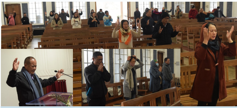
On February 2, 2021 (Tuesday) the CTC families had a prayer fellowship, dedicating the whole campus and also for the safe arrival of the students.